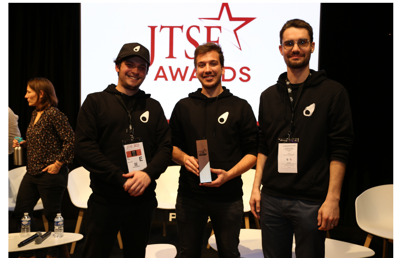
Naostage 2022 Innovation Award : hardware/software product