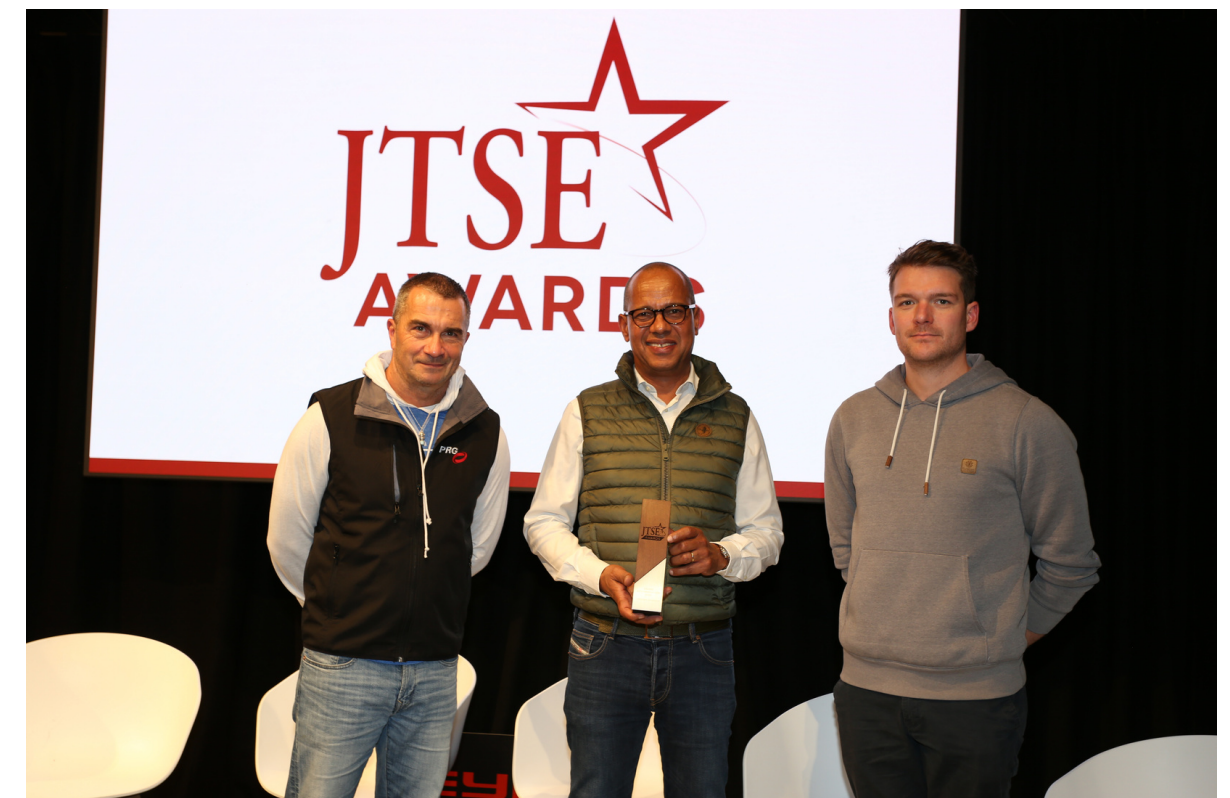
PRG France 2022 Innovation Award : technical creation