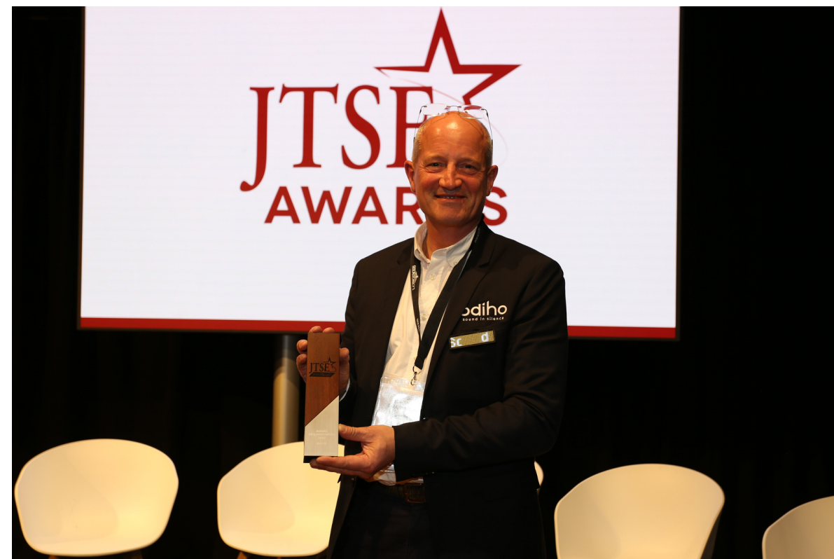
ODIHO 2022 Innovation Award : service