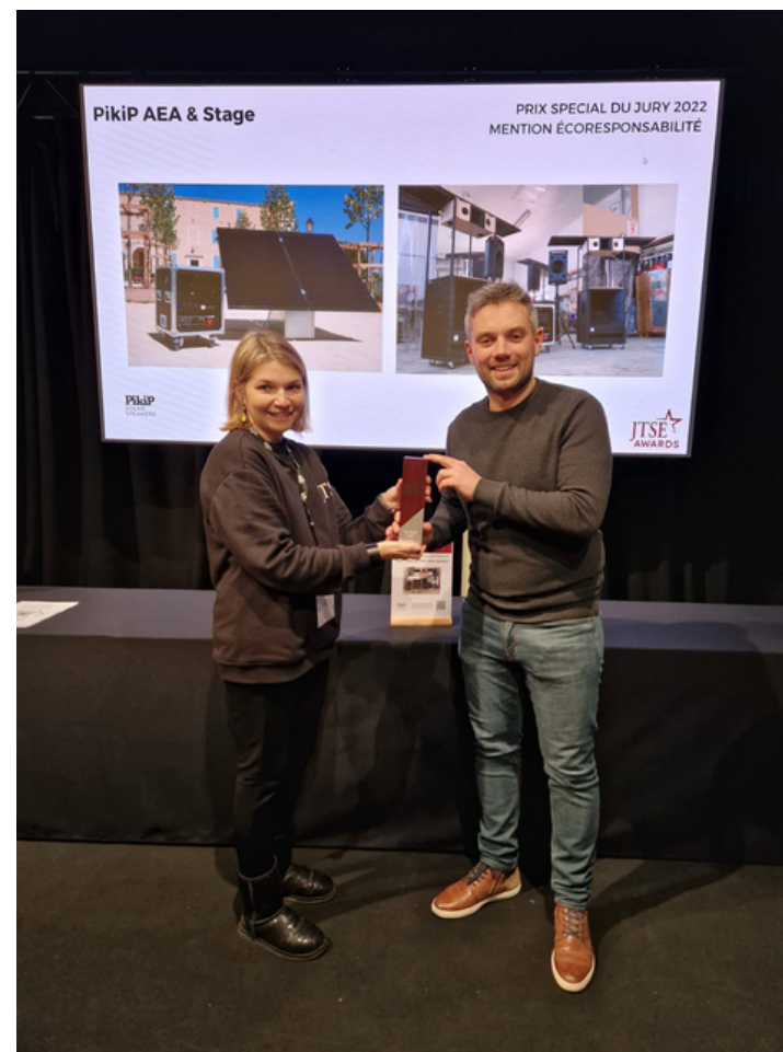
Pikip Solar Speakers Special Jury Prize for Eco-responsibility